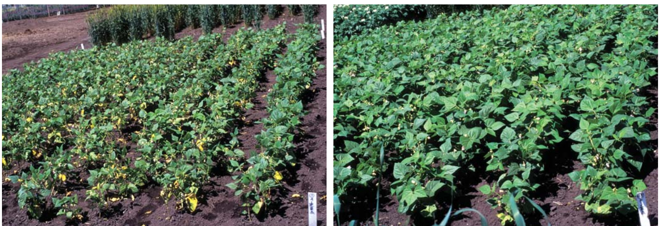
Fig. 4. Kidney bean, cultivar Taishokintoki, in monoculture (left plot) and 6-year rotation (right plot). Note stunting, yellowing plants in monoculture (left plot) and tall healthy plants in 6-year rotation (right plot). (The experiment was conducted from 1959 to 2000 at the Kitami Agricultural Experiment Station, Hokkaido, Japan. The two photos were taken on July 17, 1994).