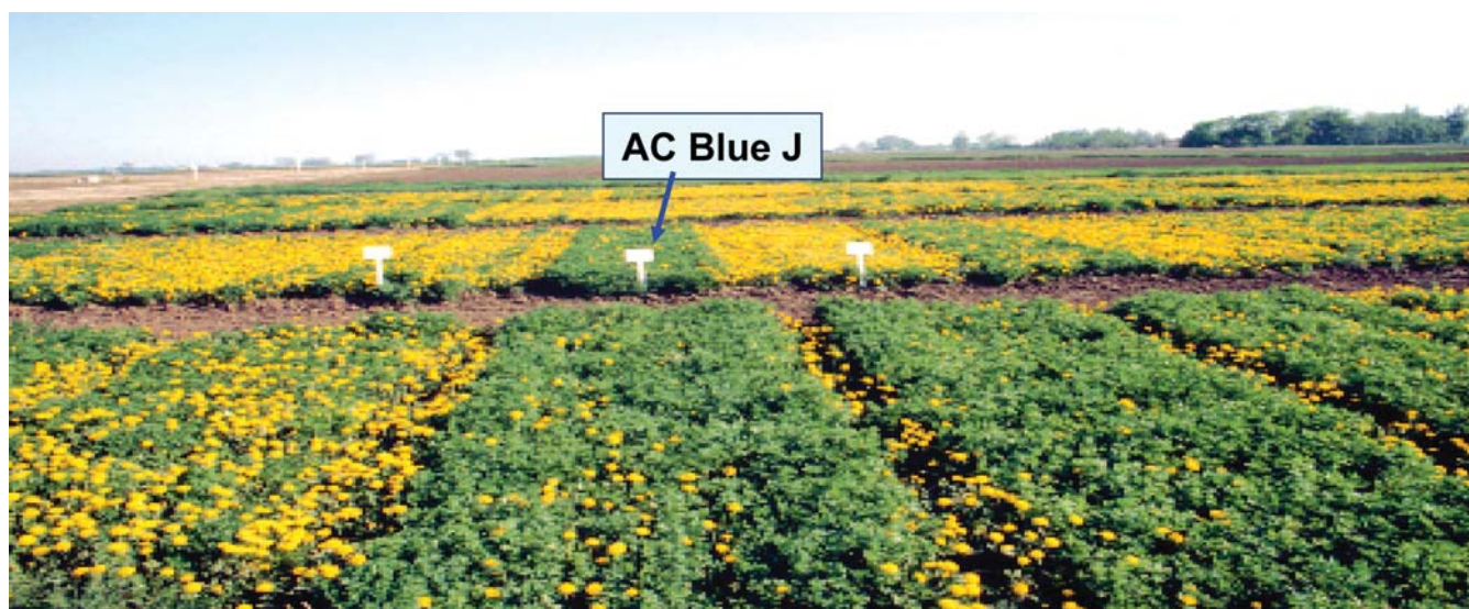
Fig. 7. Comparison of 12 alfalfa cultivars for resistance to verticillium wilt in a field naturally infested with V. albo-atrum . Note loss of alfalfa stand in susceptible cultivars due to encroachment of dandelion (yellow plots) and only light dandelion infestation in the plots of wilt-resistant cultivars (green plots), including AC Blue J (arrow).

Induced host resistance to plant pathogens, elicited by microbial invasions or chemical treatments, may offer potential for management of crop diseases (17, 32) . It results from fortification of cell walls, accumulation of phytoalexins, biosynthesis of pathogenesis-related (PR) proteins or other mechanisms (32) . For example, the intercellular fluid from salicylic acid (SA)-treated tobacco was effective in the inhibition of hyphal growth of Botrytis