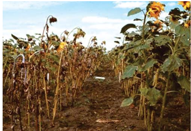
Fig. 5. Application of Coniothyrium minitans in a field naturally infested with Sclerotinia sclerotiorum reduced incidence of sclerotinia wilt of sunflower (right plot), compared to untreated control (left plot). Field experiment at Agriculture Canada Research Station, Morden, Manitoba, Canada, 1978.

Numerous studies indicate that biological control may