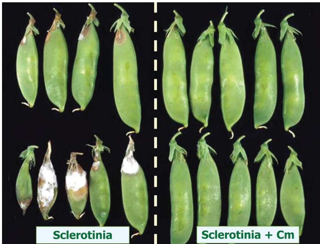
Fig. 6. Control of Sclerotinia pod rot of peas by Coniothyrium minitans ( Cm ). Note diseased pea pods from plants sprayed with pathogen alone (left) and healthy pods from plants sprayed with pathogen and Cm (right).

Methyl bromide has been used since 1930s as an effective soil fumigant for control of nematodes, fungi, insects and weeds in more than 100 crops worldwide (63) . This chemical has been classified as a Class 1 stratospheric ozone depletor (74) and has been scheduled to phase-out by 2005 in developed countries and by 2015 in developing countries (74) . Composts can provide a food base for biocontrol agents of soil-borne pathogens (31) and thereby, improve the consistency of disease control (22) . De Ceuster and Hoitink (23) reported that composts and biocontrol agents can be used as substitutes for methyl bromide in